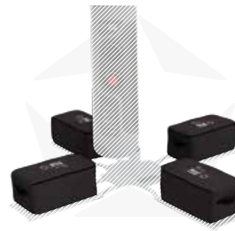
WEIGHTS FOR THE CROSS BASE

ROTATING BASE CAN BE USED IN ALL CONDITIONS, ESPECIALLY ON HARD SURFACES. IN WINDY CONDITIONS USE WITH ADDITIONAL WEIGHTS FILLED WITH SAND