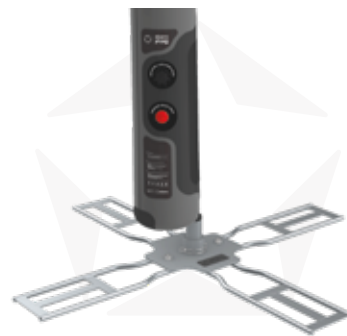
CROSS BASE WITH ROTATOR

DRIVE THE WHEEL OF THE VEHICLE ONTO THE BASE, TO OBTAIN A STABLE AND IMPRESSIVE FLAG DISPLAY