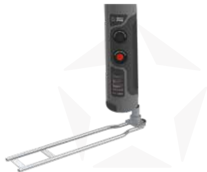
DRIVE-ON BASE WITH ROTATOR

STARX FLAGPOLES CAN BE USED ON VARIOUS SURFACES BY USING DIFFERENT BASES