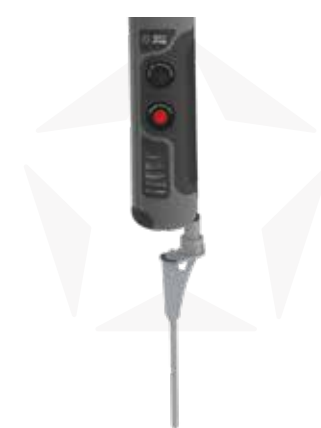
HAMMER BASE WITH ROTATOR

OPTIONAL SAND-FILLED WEIGHTS TO INCREASE THE STABILITY OF THE CROSS BASE. AVAILABLE IN DIFFERENT VARIANTS FOR EACH STARX FLAG MODEL.